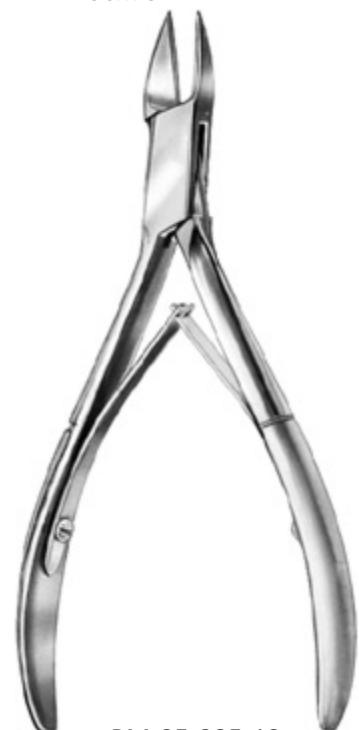
PM-25-235-13 13cm 5" Nail Nipper