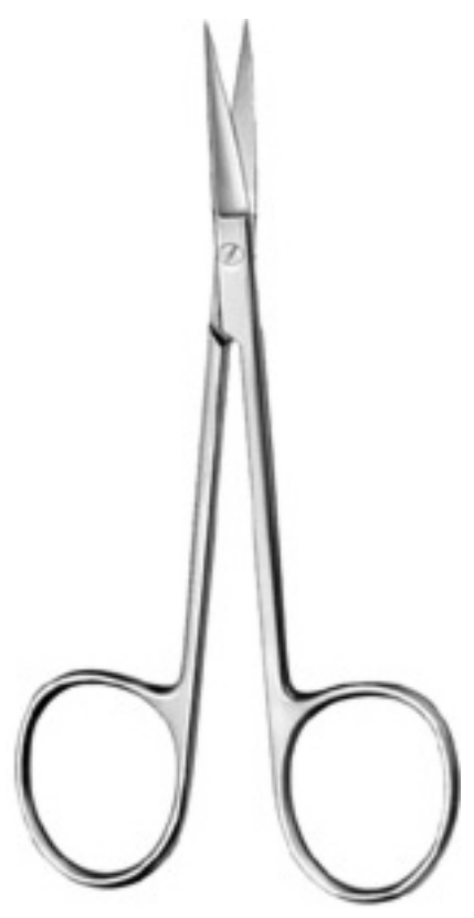
IM-25-250-10 10.5cm 4 1/2" Cuticle Scissors delicate pattern