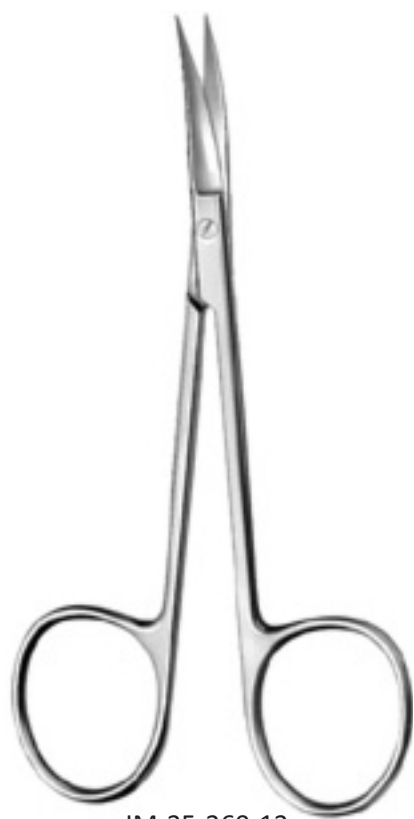
IM-25-260-12 12cm 4 3/4" Cuticle Scissors delicate pattern