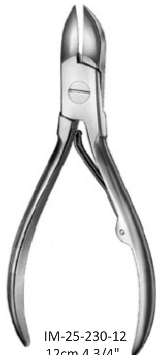
IM-25-230-12 12cm 4 3/4" Nail Nipper