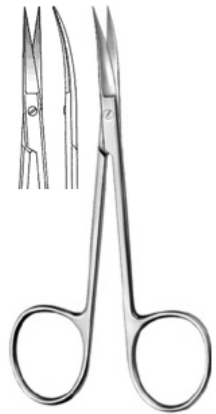
IM-25-255-10 10.5cm 4 1/2" Cuticle Scissors delicate pattern