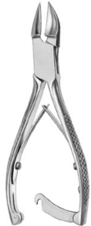
IM-25-225-13 13cm 5" Nail Nipper