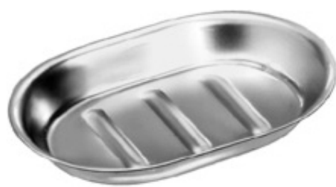
IM-25-100-12 Soap Dish 110 x 75 x 13 mm