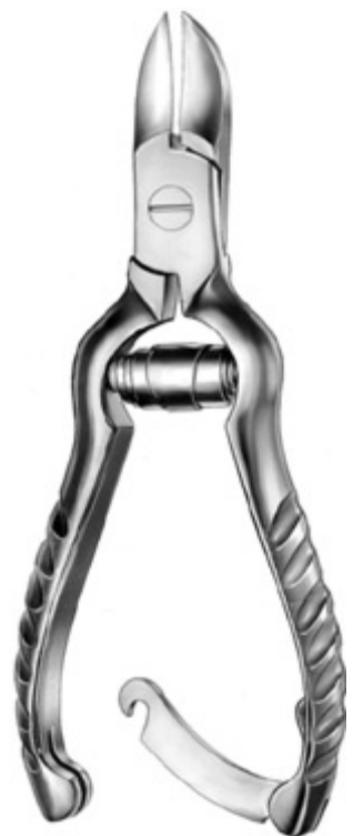
IM-25-220-11 Turnbull 11.5cm 4 1/2" Nail Nipper