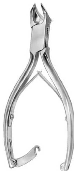
IM-25-210-14 14cm 5 1/2" Nail Nipper