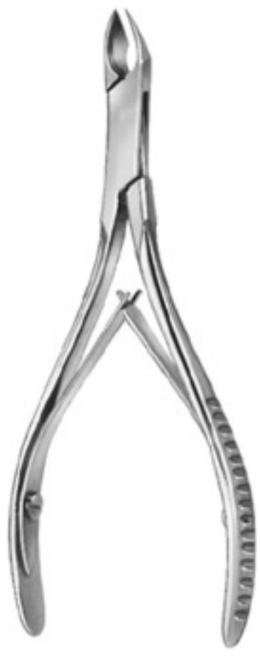
IM-25-240-11 11cm 4 1/2" Cuticle Nipper