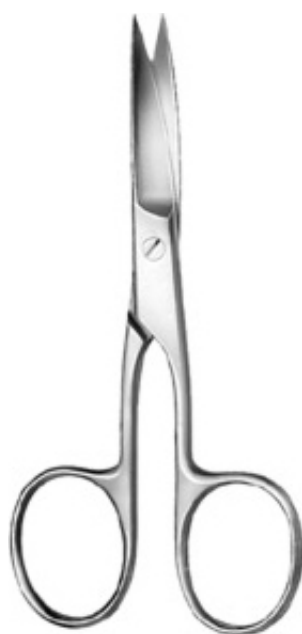
IM-25-205-10 10.5cm 4 1/4" Nail Scissors