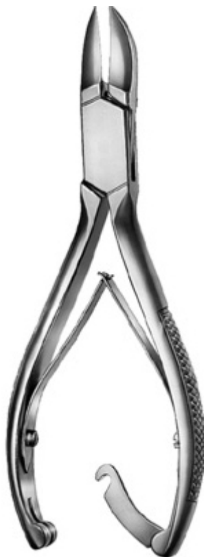
IM-25-215-14 14cm 5 1/2" Nail Nipper