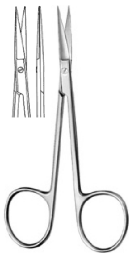
IM-25-255-12 12cm 4 3/4" Cuticle Scissors delicate pattern