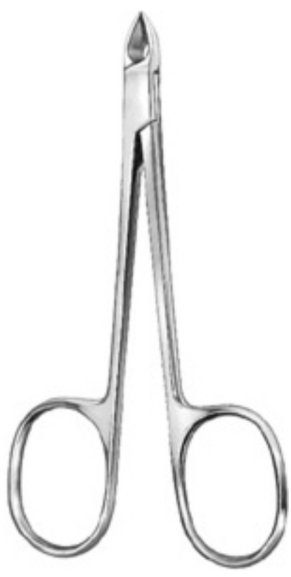
IM-25-345-13 13cm 5" Cuticle Nipper ZI-54-373-10 10.5cm 4 1/2" Cuticle Nipper delicate pattern