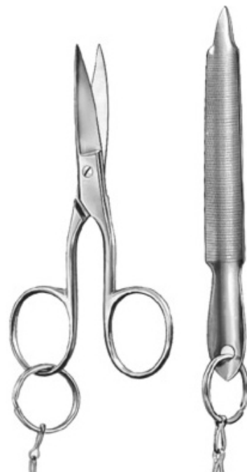
IM-25-200-10 Hospital Nurse Setcon sisting of nail scissors and nail file, with chain Hospital Nurse Set