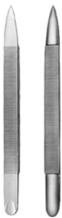
IM-25-265-10 9cm 3 1/2" Nail File